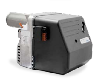
Burner D3, D4, D6